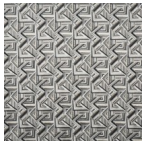
Prestigious Textiles Cuba Ramiro 4079/930