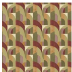
Prestigious Textiles Cuba Varadero 8778/397